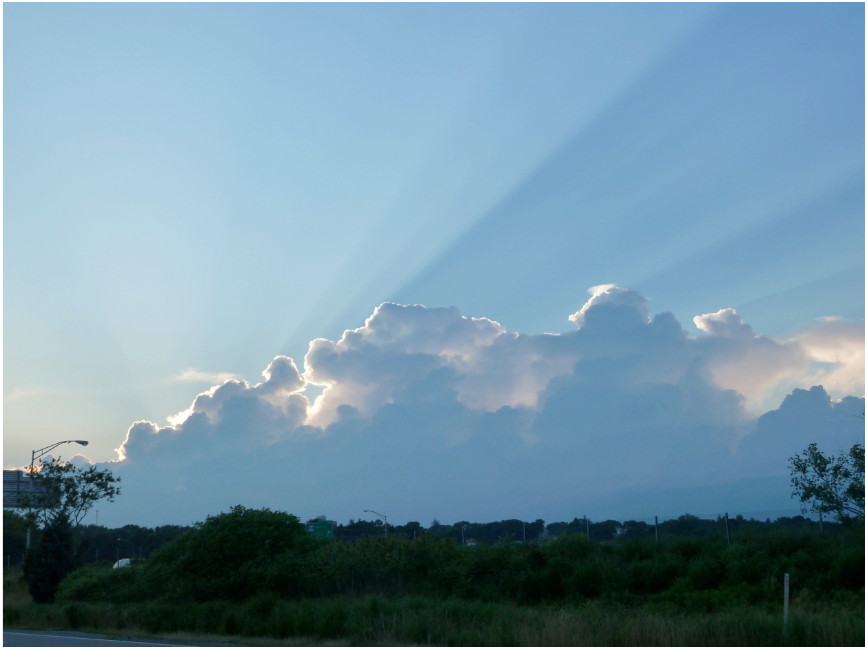
Sunset near Horseneck Beach

For more information, contact Roger Solomon ( roger.solomon@yahoo.com or 860-420-6249)